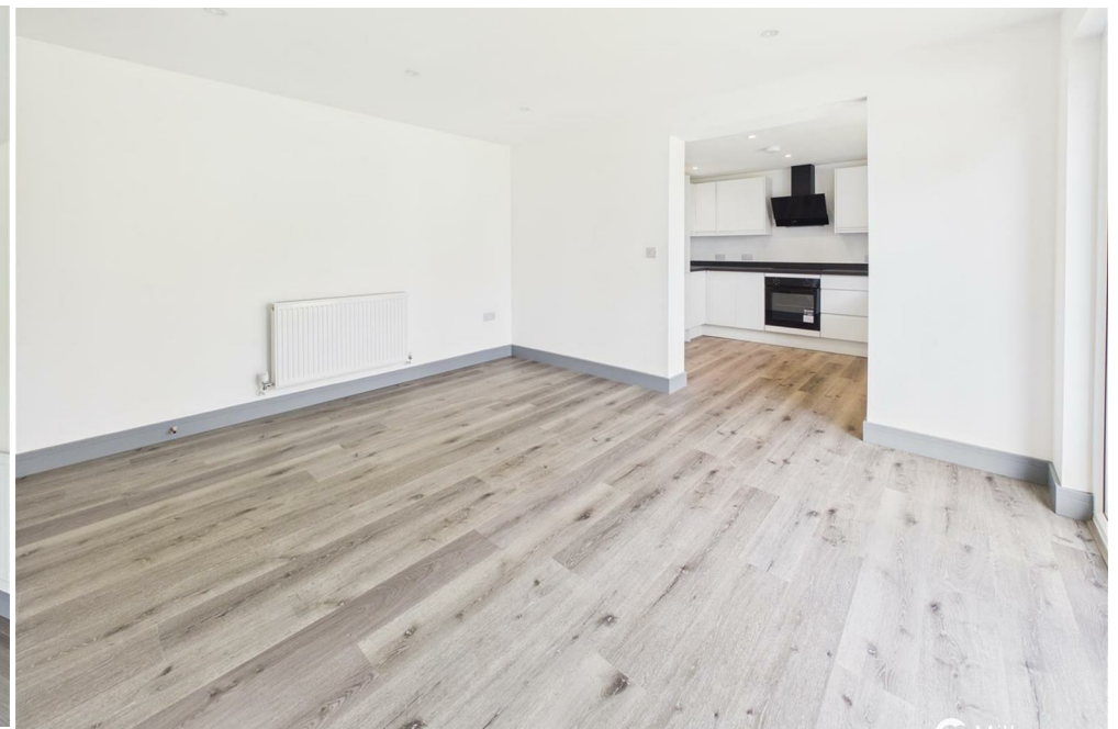
Little Gregwartha, Four Lanes, Redruth, TR16 6LN